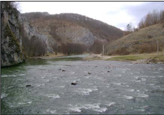
Figure 4. The Crișul Repede Defile at Șuncuiuș, Bihor County