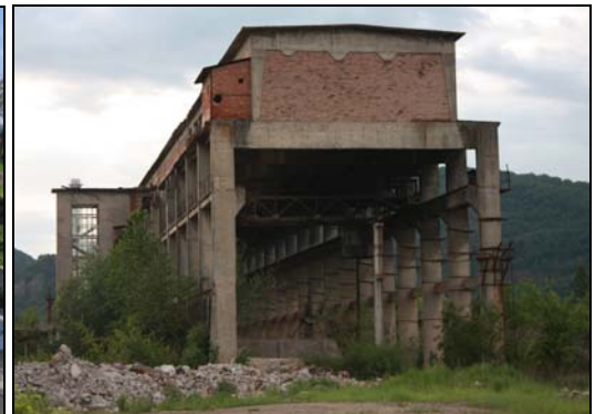
Figure 7. Brownfield site in Șuncuiuș, Bihor County