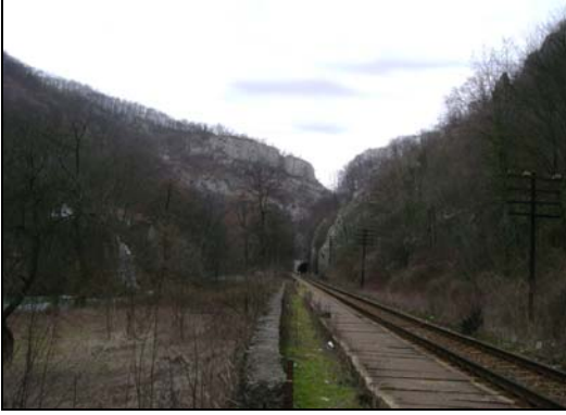
Figure 2. The Cluj-Napoca-Oradea railway in the Crișul Repede Defile