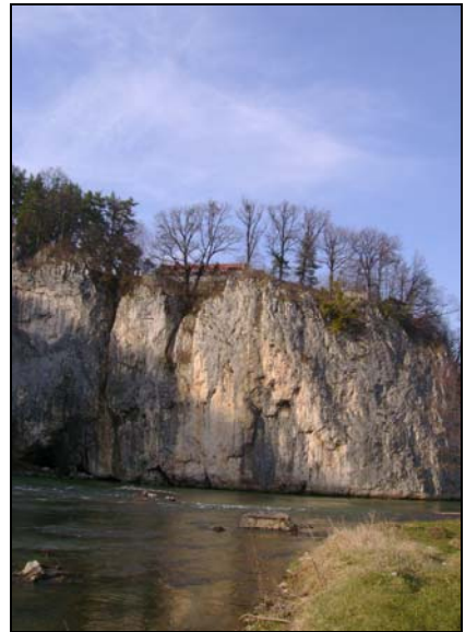
Figure 5. The Castle from Șuncuiuș, Bihor County