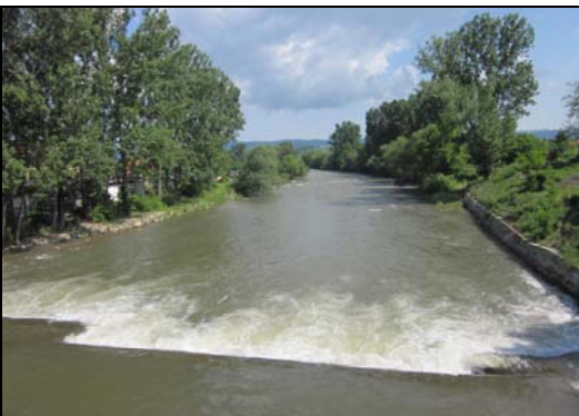
Figure 6. Crișul Repede River at Vadu Crișului, Bihor County