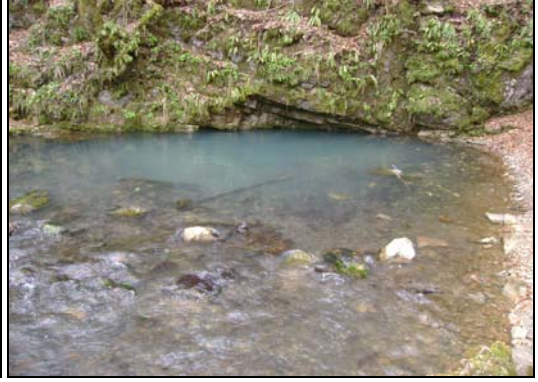
Figure 3. The Izbândiș Karst Sprig, in Șuncuiuș, Bihor County